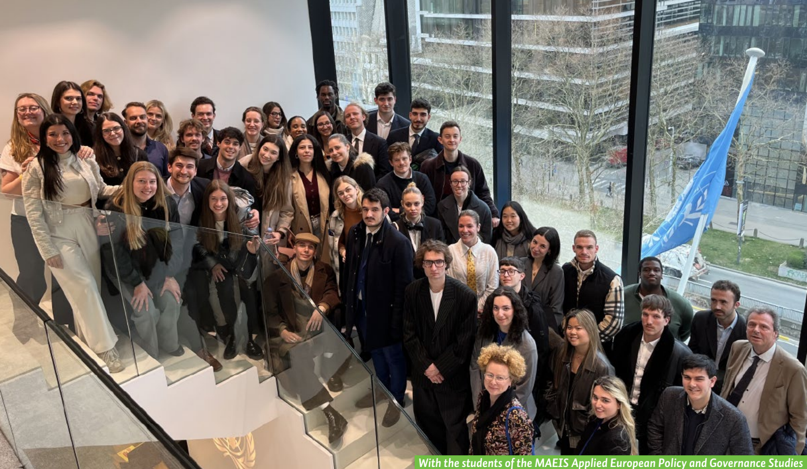
With the students of the MAEIS Applied European Policy and Governance Studies