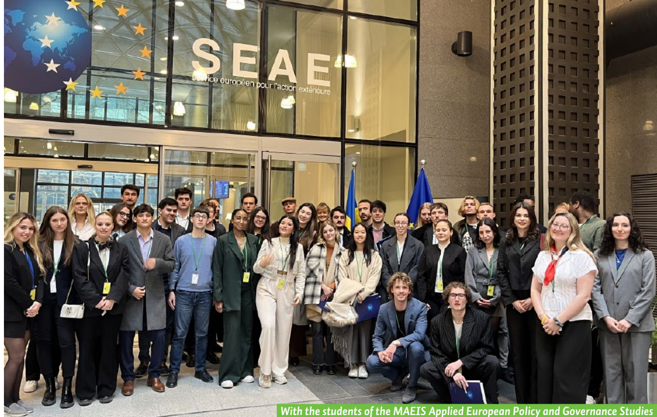
With the students of the MAEIS Applied European Policy and Governance Studies