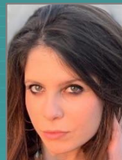
Floriana GIANNOTTI Italy