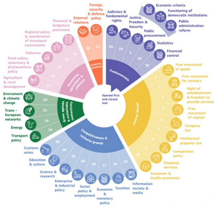
Fig 2: The 33 negotiating chapters for EU accession

Notwithstanding the explicit statements from official sources that the EPC neither substitutes EU enlargement, nor resembles the roles of the Council of Europe, the OSCE or NATO, building thematic bridges to these institutions will automatically happen due to the thematic overlap. The Council of Europe, with its emphasis on human rights, democracy and the