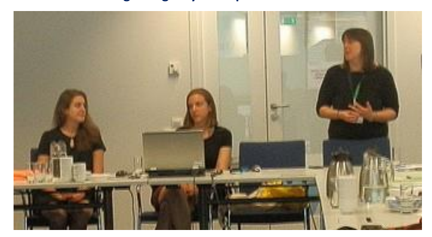
10.00h FRONTEX (the European Border and Coast Guard Agency) Visit of the building of Agency headquarters in Warsaw