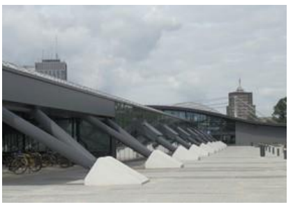
Visit of Lodz Fabyczna station and the old business and financial district