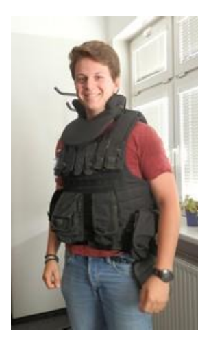
13.00h: Visit of MORATEX, the smart technologies companies in Lodz a company working for the research of smart technologies (anti-ball jackets)