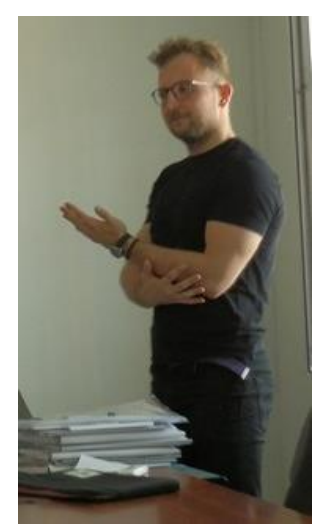
"The Energy security in the Baltic Sea Area" "The Baltic Sea Energy Policy"

Saturday July 15<sup>th</sup>, 2017: 9.30h