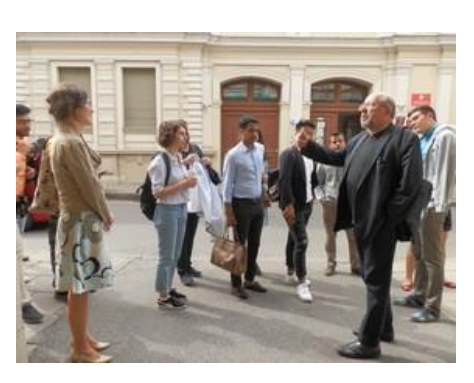
Walking tour in the historic town