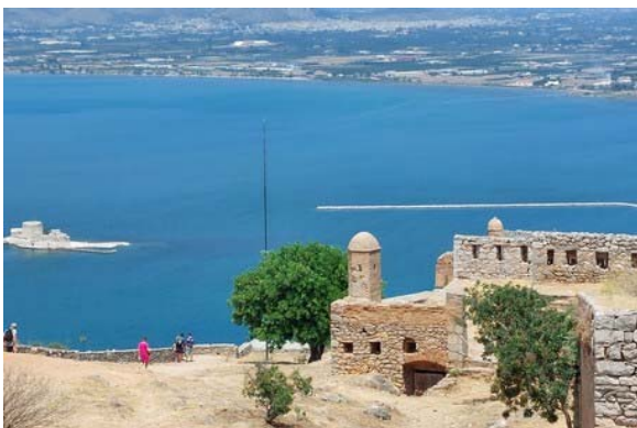
The corynthe channel