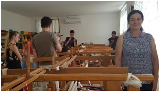
“GUR I ZI social business”

Visit to small companies to explain the development of the economy in small regions through the investment of small family companies