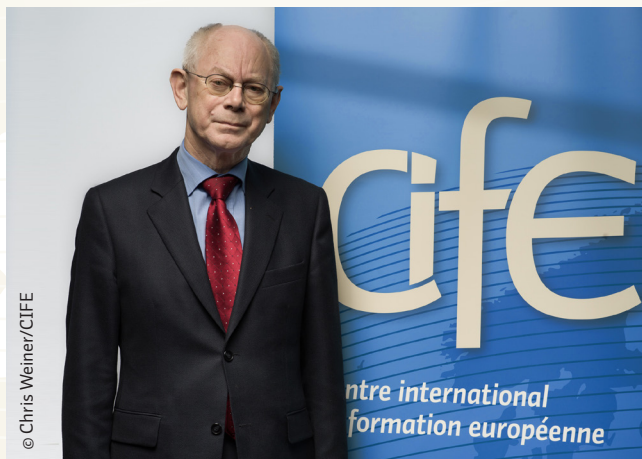
Herman Van Rompuy

Contact CIFE Communication for more pictures in High Res.