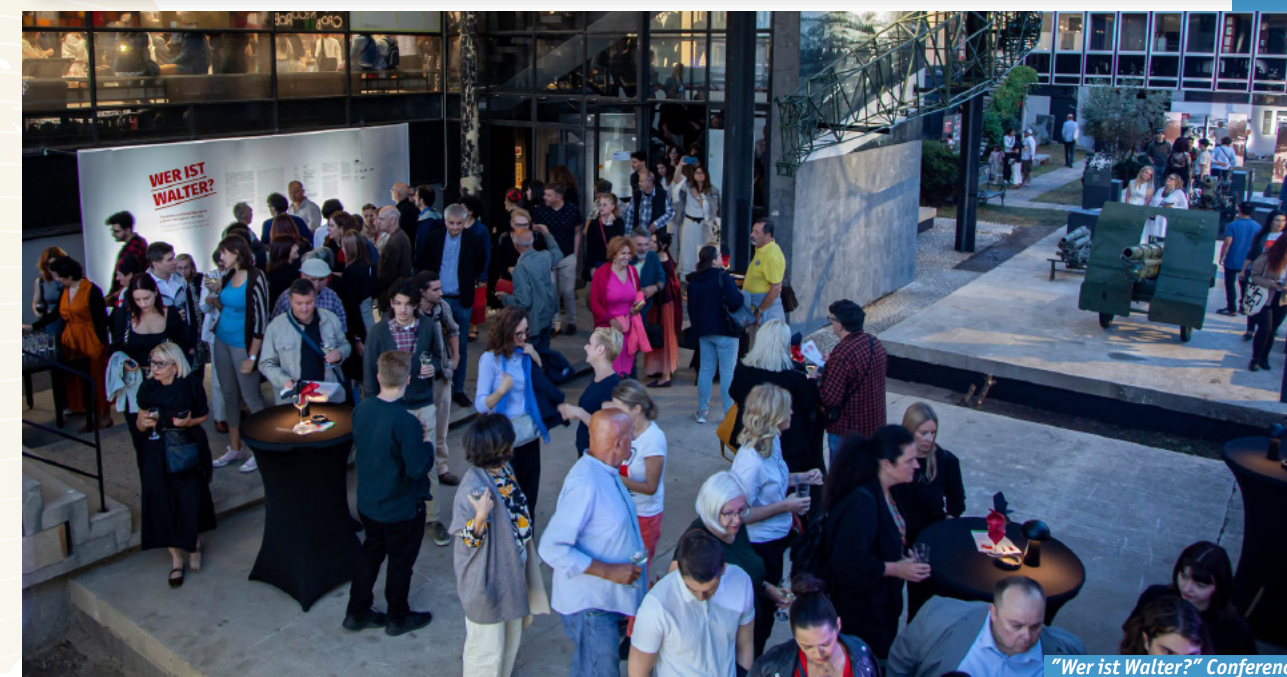
“Wer ist Walter?” Conference