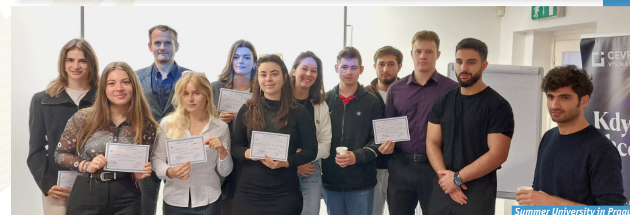
Summer University in Prague