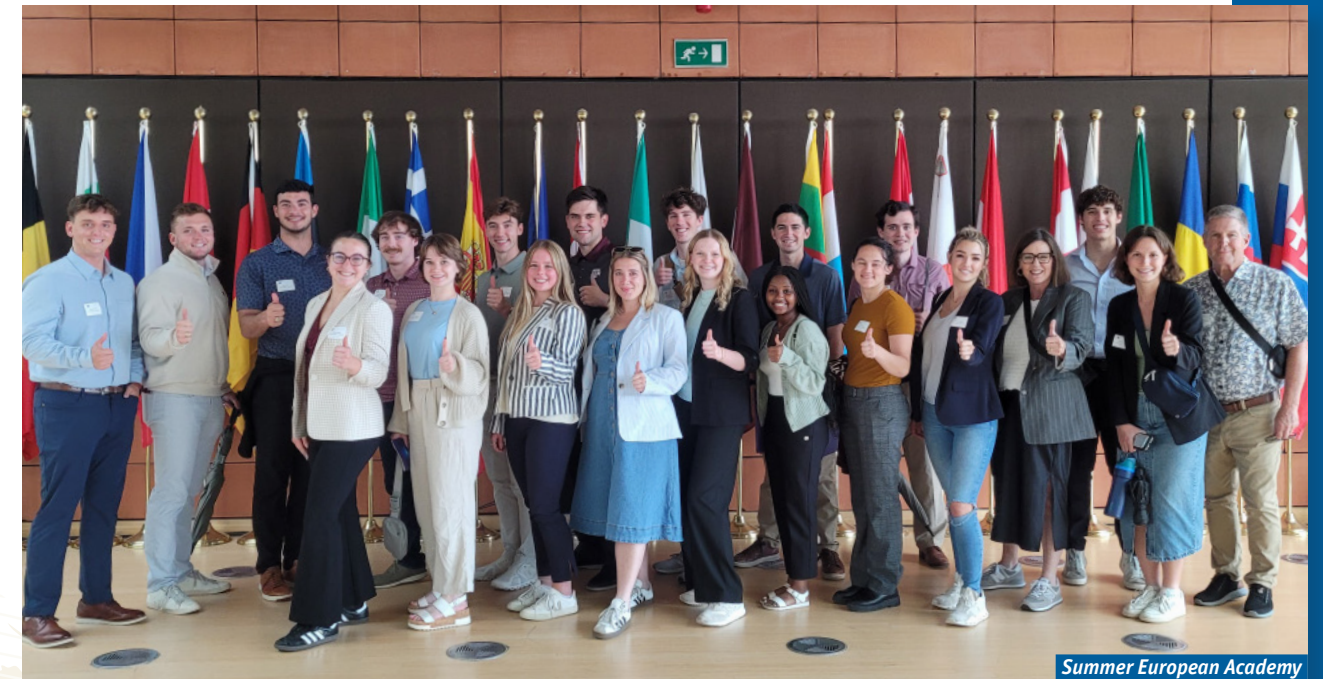
Summer European Academy

The EU–China Summer School was organised again in person for the first time since 2019. The aim of the summer school was to provide Chinese students with a solid understanding of European integration, European politics and EU-China relations. 11 postgraduate/undergraduate students from Yunnan University and 1 undergraduate student from Kunming Medical University participated in the programme. The group had a diversified programme consisting of academic lectures, visits to EU institutions as well as city tours and cultural visits in Frankfurt am Main, Nonnweiler and Brussels. A particular highlight for the students was the visit to the Mission of the People’s Republic of China to the EU.