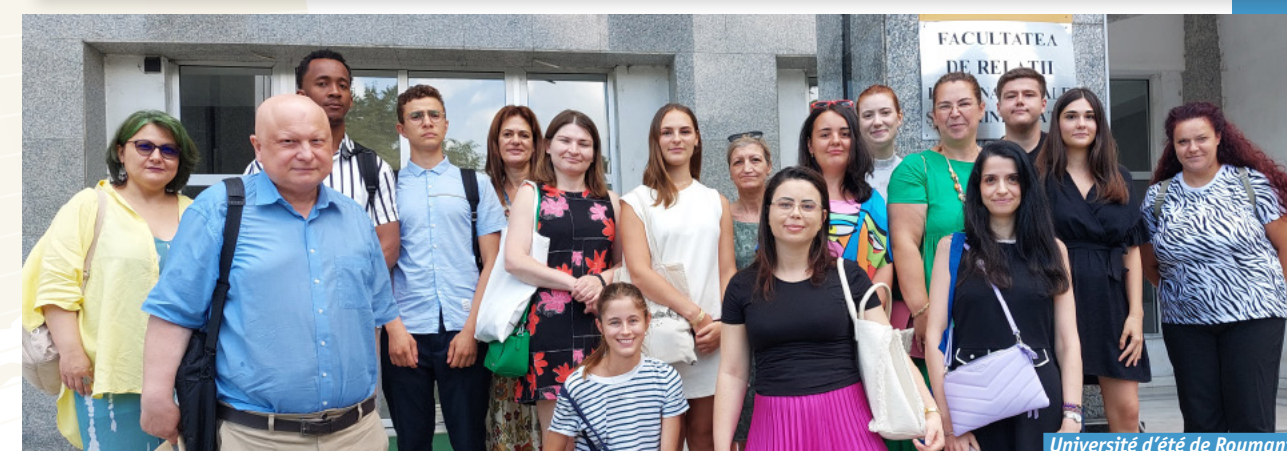
Université d'été de Roumanie