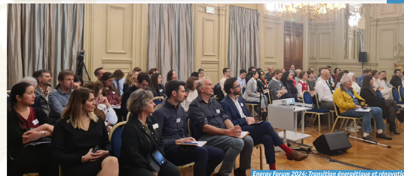
Energy Forum 2024: Transition énergétique et rénovation