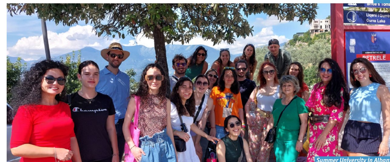
Summer University in Albania

The course focussed on the Russian aggression against Ukraine and its consequences for the European Union, in particular in Central and Eastern Europe. Through several case studies, participants analysed perspectives on the new geopolitics of European integration discussing whether the EU's centre of power is moving East. They also followed courses on Europe's energy crisis triggered by the war in Ukraine. The summer course offered a rich cultural programme of visits in Prague.