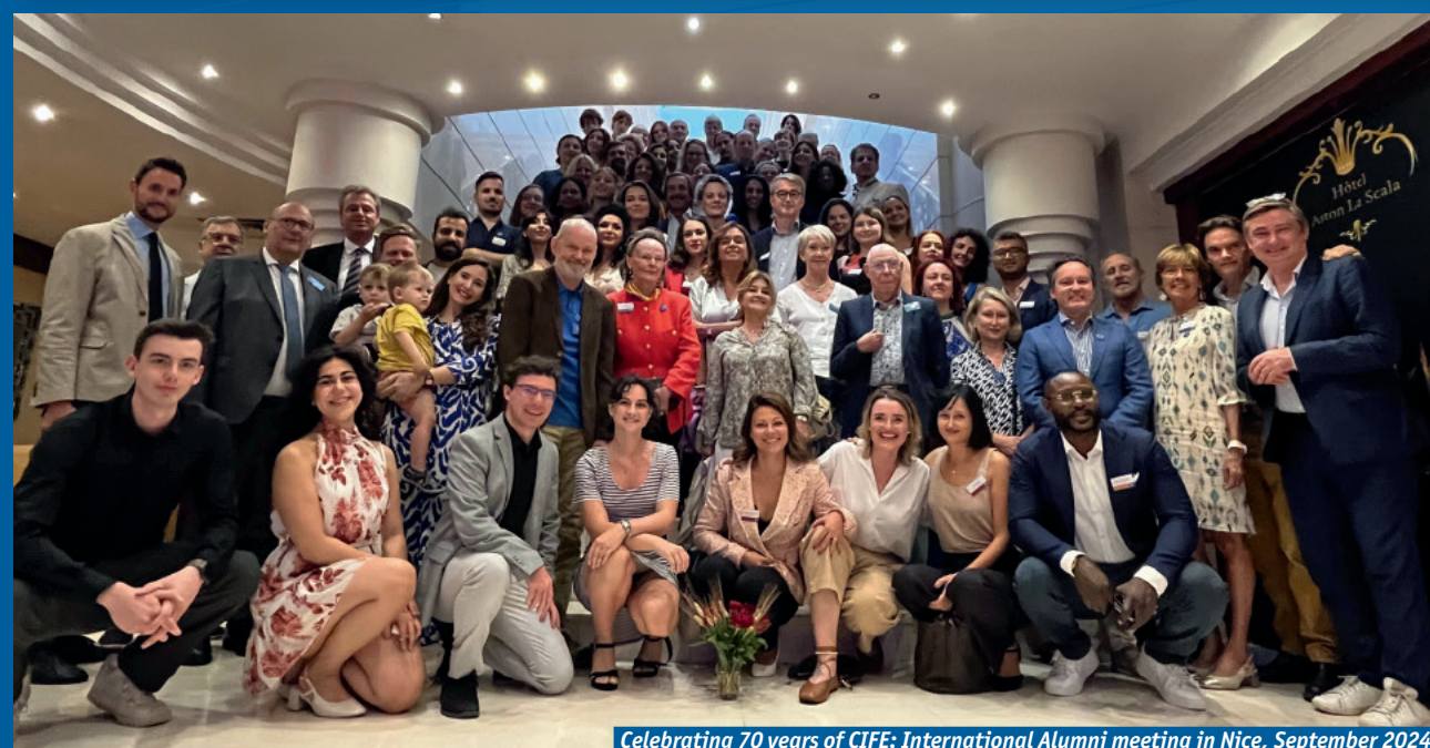
Celebrating 70 years of CIFE: International Alumni meeting in Nice, September 2024