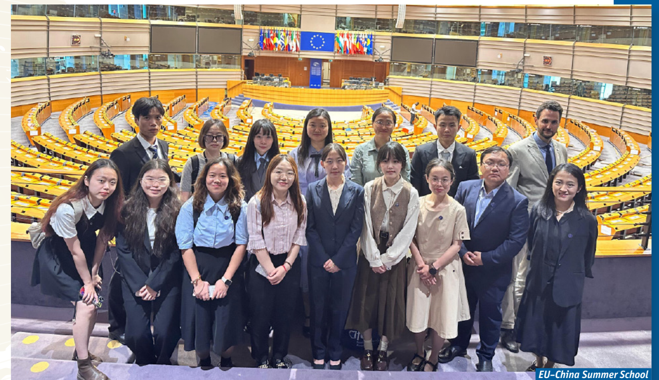
EU–China Summer School