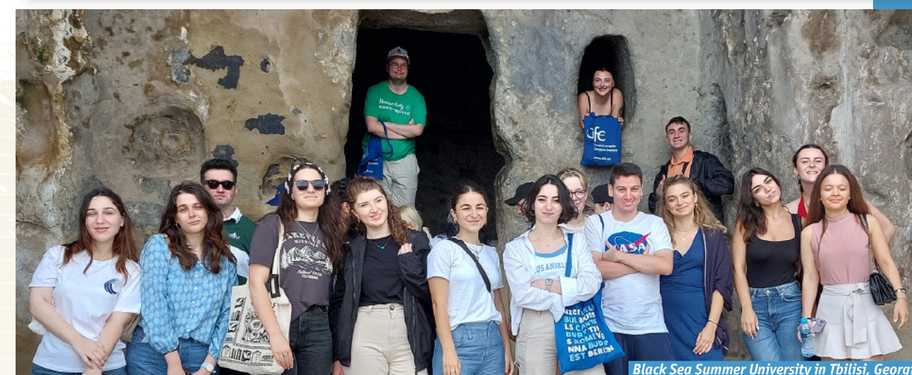
Black Sea Summer University in Tbilisi, Georgia