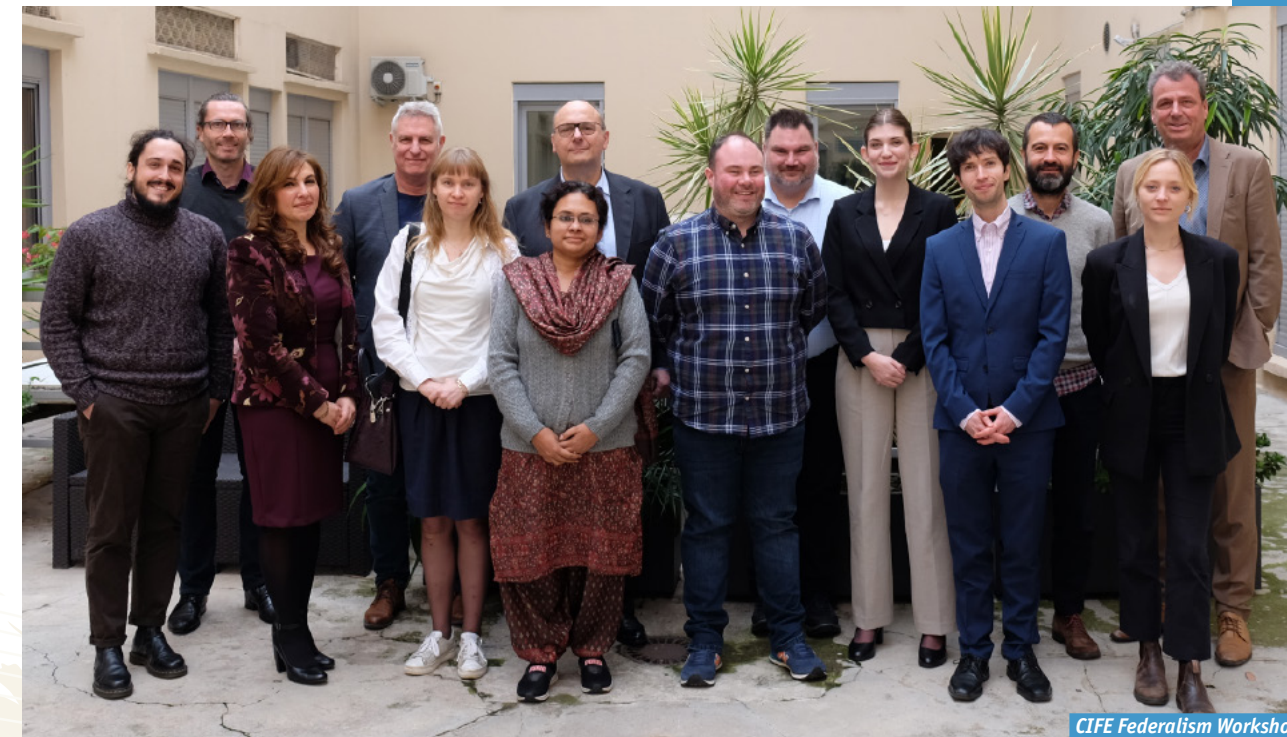
CIFE Federalism Workshop