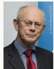
Herman VAN ROMPUY President Emeritus of the European Council Former Prime Minister of Belgium President of CIFE